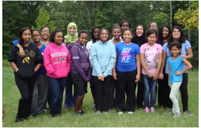
Our Visit to Yogaville