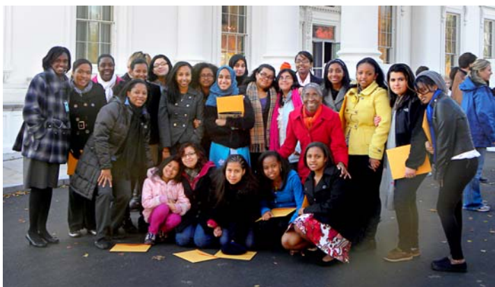
Our Visit to the White House