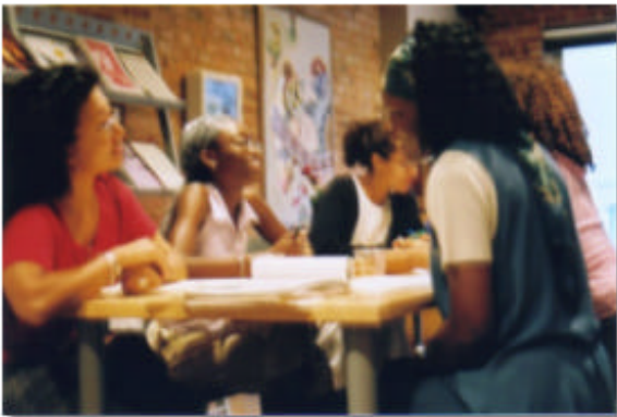
SisterMentors helps women of color complete their dissertations and get their doctorates.